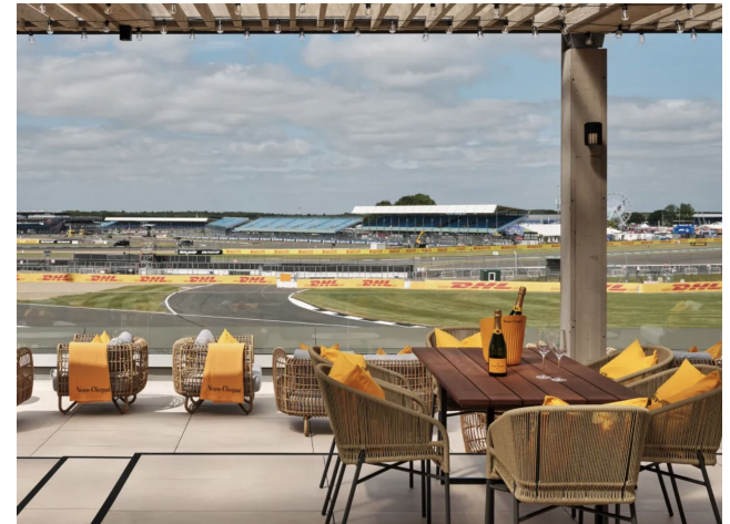
The vast terrace of Escapade — the premier place to watch the races

At Escapade you can watch all the racing action from your bed, your terrace or even the swimming pool. And if you need a wellbeing pitstop, the F1 osteo Gemma Fisher is in the spa, ready to perform her magic